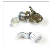
125-1073 Key Lock 125-1678 Hex Lock