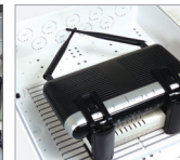
Rail Mounting System (RMS)