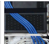
Shelf Mounting System (SMS)