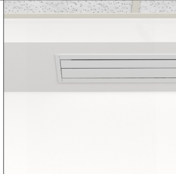
In Ceiling (Closed)