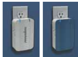
Front cover can easily be removed & painted to match any wall color.