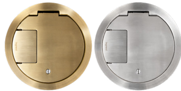
Brass Stainless Steel