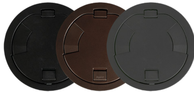
Black Bronze Gray