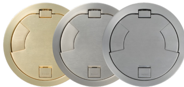
Satin Brass Satin Nickel Brushed Aluminum