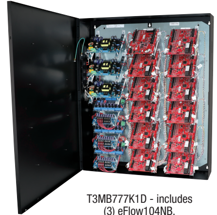
T3MB777K1D - includes (3) eFlow104NB, (3) ACMS8CB, (3) PDS8CB, wire harnesses and management