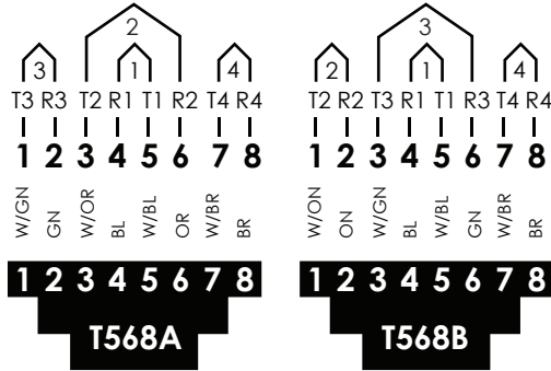
Figure 1: Wiring Schemes