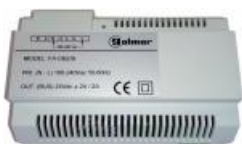
(1) FA-G2 System Power Supply/Amplifier