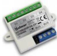
D4L-G2/SMALL 4-way video bus splitters (qty. of 0 to 3 depending upon kit selected)