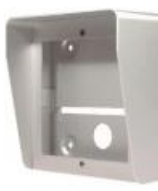
(1) Surface aluminum back box with standard rainhood for the NEXA panel (model# N871/AL shown)