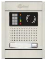
(1) Aluminum NEXA Door Station (supplied with SURFACE back back box), with 1 to 10 push-buttons. 1-Button model shown