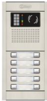
(1) Aluminum NEXA Door Station (supplied with SURFACE back back box), with 1 to 10 push-buttons. 10-Button model shown