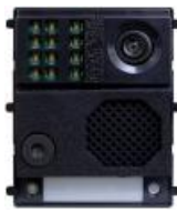
(1) EL632/G2SE Camera and Speaker/Mic. Module (installed into the NEXA panel)