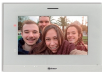
ART7LITE/G2 Surface Mount 7.0" Indoor Video-Intercom Monitors (qty. of 1 to 10 depending upon kit selected)