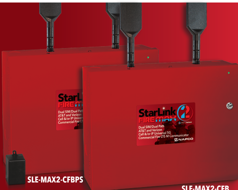
Dual SIM/Dual Path StarLink Fire MAX 2 also available in Metal enclosures with or without power supply