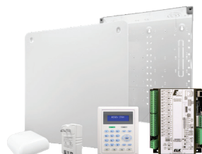
ELK-E27SYS2 Includes E27CB Board, AEKP Keypad, P1426 Power Supply, 73 Speaker, and SWB14P Plastic Enclosure