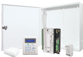
ELK-E27SYS1 Includes E27CB Board, AEKP Keypad, P1426 Power Supply, 73 Speaker, and SWB14 Metal Enclosure