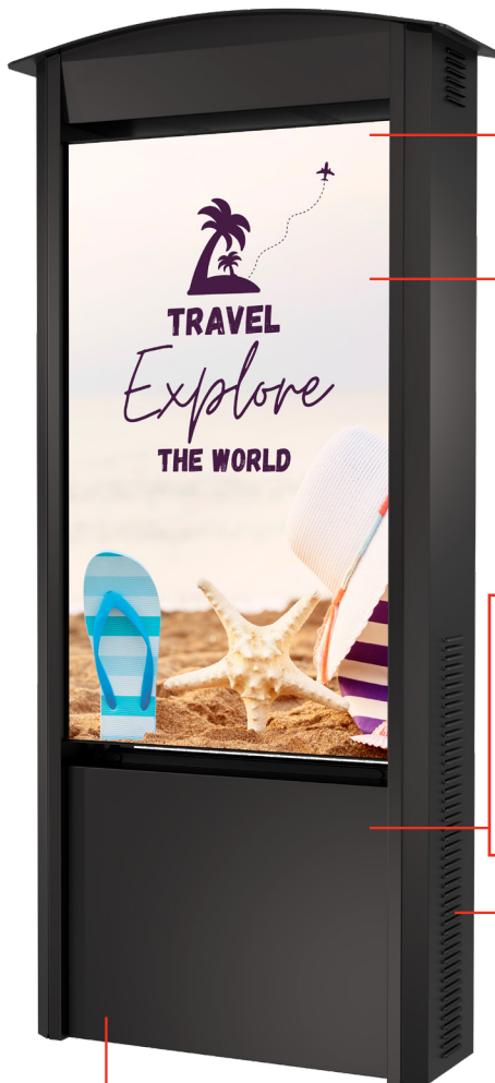
Model Shown: KOP55XHB2-EUK

Upgrade your current signage with a brand new Peerless-AV® Dual-Sided Smart City Kiosk. This next generation Smart City Kiosk will allow you to replace dynamic, digital content quickly, easily, and remotely, drawing in more engagement than your previous static signage. By combining a sleek, modern aesthetic with an approachable and easy-to-use design, the Smart City Kiosk puts functionality at the forefront. A 10-point IR touch overlay can also be added, on one or both sides of the kiosk, for an interactive customer experience. Outdoor elements are no match for this kiosk because it is all-weather rated, highly durable, and built to last. Maintenance and installation are also simplified with no cranes or forklifts needed. The Smart City Kiosk comes packed with ample component storage and two 55" Xtreme™ High Bright Outdoor Displays with full HD1080p resolution. Even when placed in direct sunlight, you are guaranteed a bright and crisp picture when sharing digital signage content - Whether that is focused on travel, wayfinding, advertising, weather, entertainment, and more.