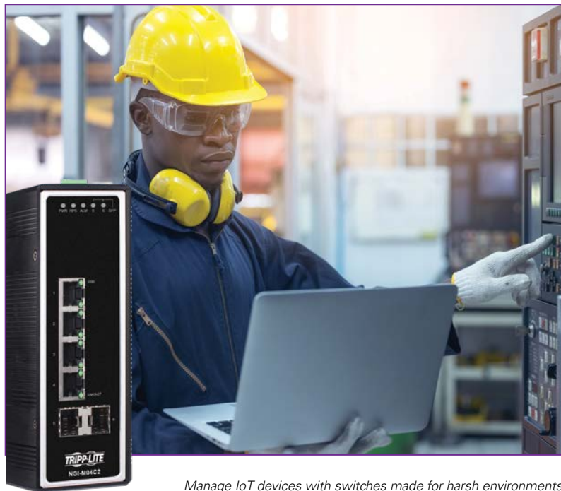
Manage IoT devices with switches made for harsh environments.