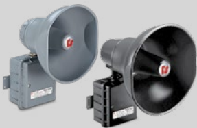
Models 300GCX and 300GCX-CN (15W), 302GCX and 302GCX-CN (30W)

Vibratone® Hazardous Location Electronic Horn