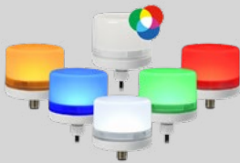
Models LP57 and LP57 RGB

Radiant Configurable Stack Light with up to 7 Modules and 5 Mounting Options