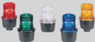
Models LP3M, LP3P and LP3S

Fireball® Supervised Hearing Impaired Strobe Lights