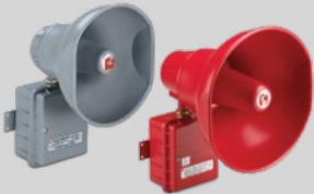
Models AM300GCX (15W) and AM302GCX (30W)

SelectTone® Hazardous Location Supervised Amplified Speakers