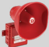
Models ASHH (15W) and ASUH (30W)

Hazardous Location Remotely Selectable Electronic Siren