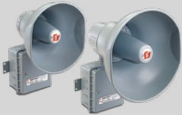
Models 304GCX and 304GCX-CN (15W), 314GCX and 314GCX-CN (15W)

SelectTone® Hazardous Location Amplified Speakers