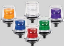
Models 225XST and 225XST-I

Electrarray® Hazardous Location LED Flashing Light