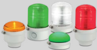
Models SLM100, SLM200, SLM300/350, SLM1400/1450 and SLMB, SLMBD and SLMBP

StreamLine® Modular Multifunctional LED Beacons and Mounting Options