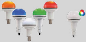
Models PM22L and PM22L RGB