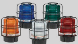
Models FB2LEDX and FB2LEDX-QC

Hazardous Location Commander® LED Rotating Light