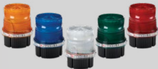
Models FB2LED and FB2LED-QC