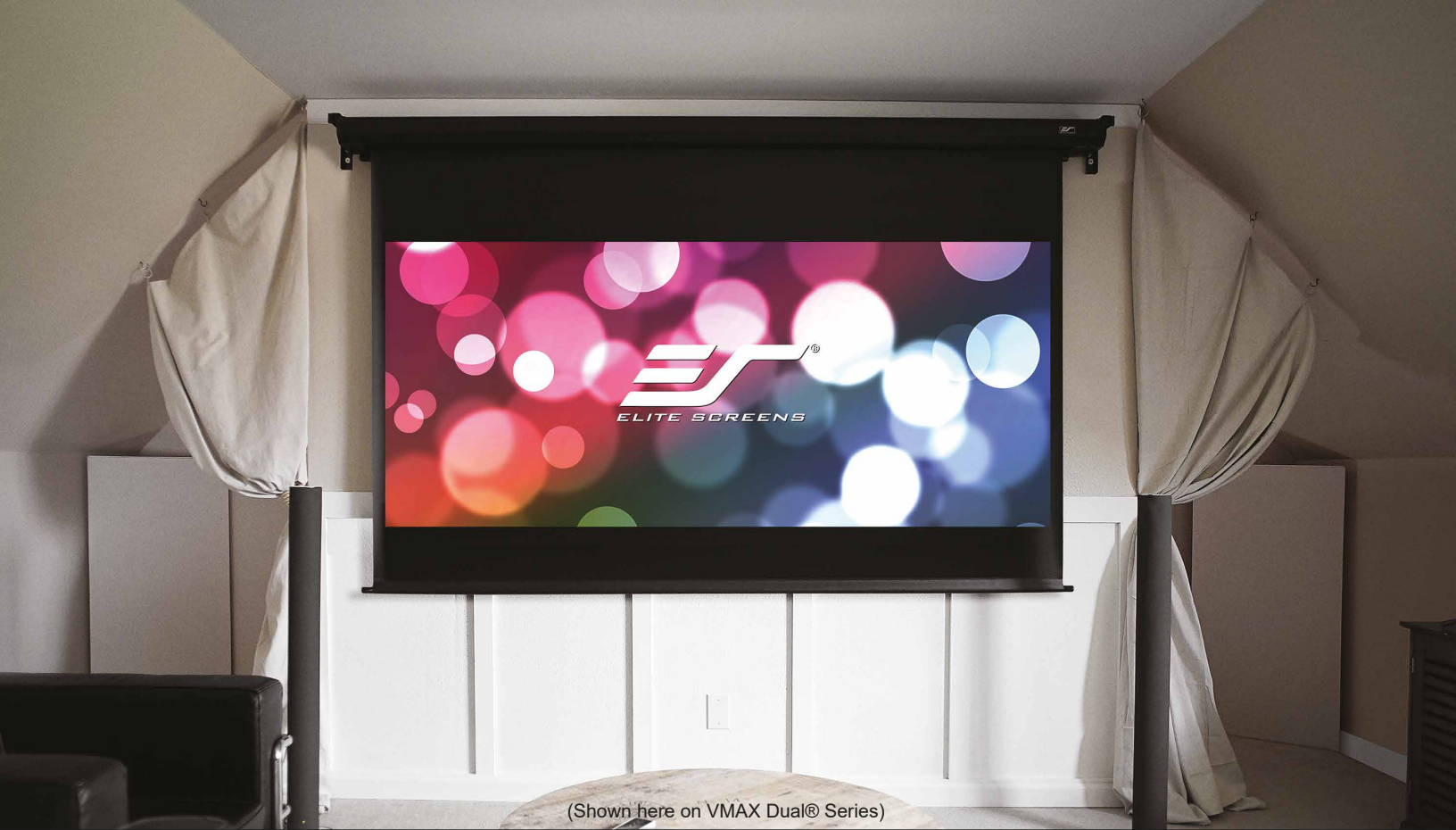
(Shown here on VMAX Dual® Series)

MaxWhite® Screen Material is the most versatile screen surface for front projection presentations. This material provides the widest possible viewer angles with perfect diffusion uniformity while giving precise definition, image color reproduction and black & white contrast. Screen Surface has black-backing to avoid light penetration and can be cleaned safely with mild soap and water. Woven screen material is a multi-layer, cross-array coated with a matte white reflective compound.