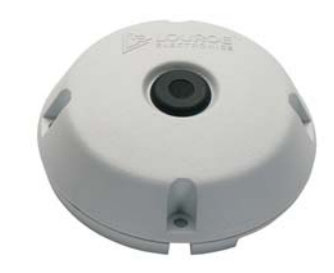
MODEL A USB MICROPHONE

The Model Verifact A USB is an omni-directional, low impedance, electret condenser microphone with a USB audio output. It can pick up normal sounds approximately 15 ft. away, or within a 30 ft. diameter circle. It is primarily designed for ceiling mounting but can also be installed on any type of flat surface. The Verifact A USB is compatible with a device that accepts USB audio input.