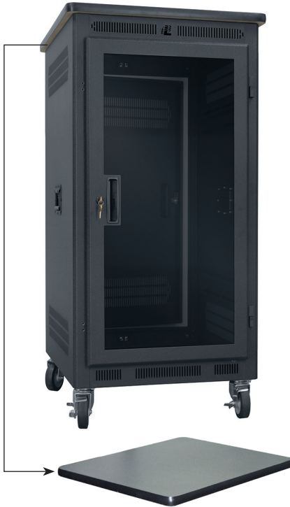
The LPR--PGT Series rack includes a 1"H premium Graphite Grey laminate top with rubber edge molding, which attaches to (and hangs over) the rack's standard steel top.