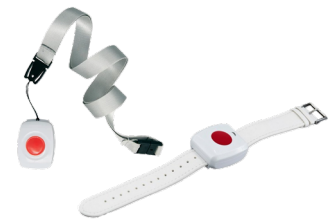
pendant transmitter with wrist band option