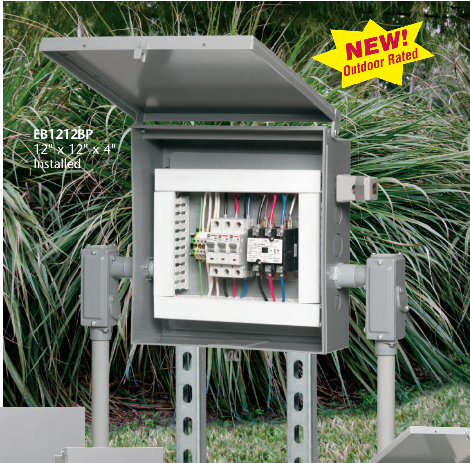
EB1212BP 12" x 12" x 4" Installed

Heavy-duty, Non-metallic • Protect Devices, Backups...More!