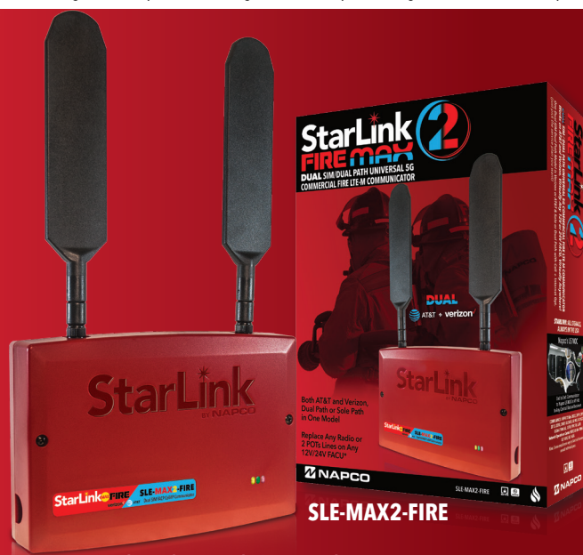
Universal Panel-Powered Commercial Fire FACU Communicator: Dual SIM for 2 Networks; Dual Path Cell Only or Cell/IP All in One Model