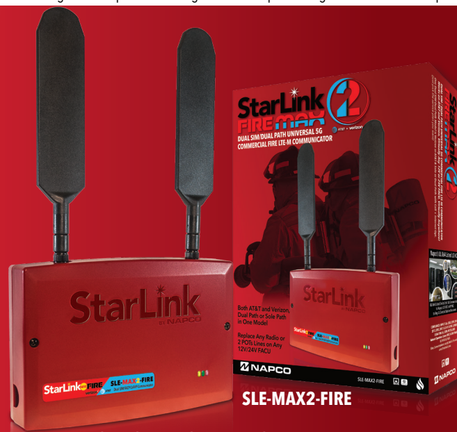
Universal Panel-Powered Commercial Fire FACU Communicator: Dual SIM for 2 Networks; Dual Path Cell or Cell/IP all in One Model