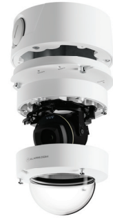
VC847PF mounted to AM-71B-PS