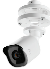
VC728PF mounted to AM-52E