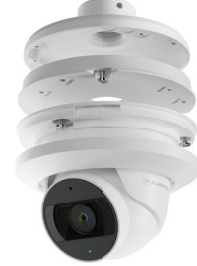
VC838PF mounted to AM-528