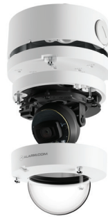
VC827P mounted to AM-71D