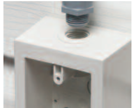
3 Use the threaded openings to add another Outlet Box!

Use the threaded openings to add another Outlet Box!