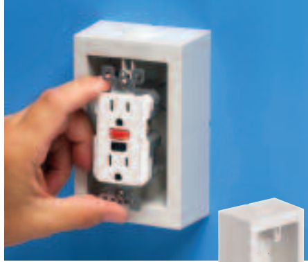
2 Install receptacle.