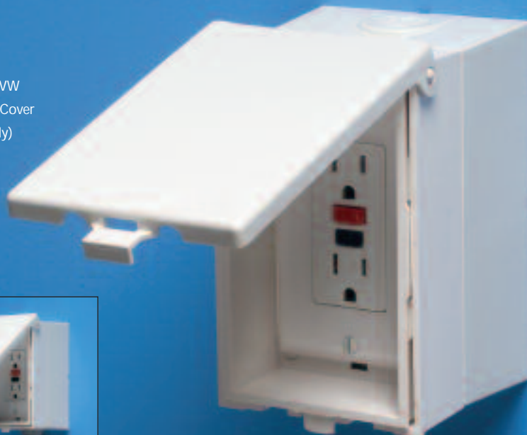
FS8161T Outlet Box for flat surfaces

Shown with Arlington's 60VV IN and OUT™ Cover (sold separately)