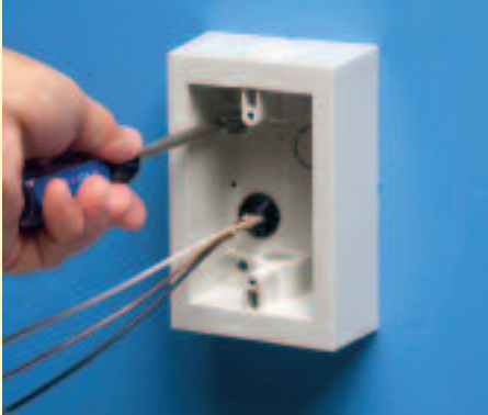
1 Pull wire. Attach box to flat surface.