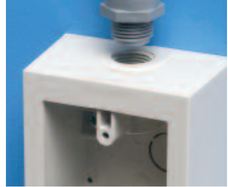
3 Use threaded opening(s) and PVC conduit to install additional outlet boxes.