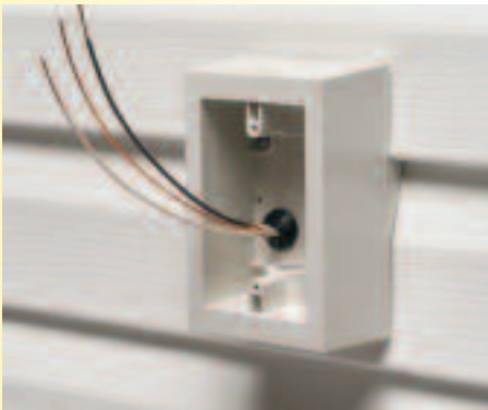
1 Pull wire. Attach the appropriate adapter to the FS8161T box and install on siding.