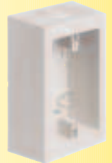
FS8161T for flat surfaces

Install a receptacle where you need it; add another outlet box later. It's easy with Arlington's non-metallic threaded-opening outlet boxes.