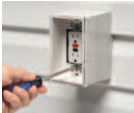
2 Install receptacle.