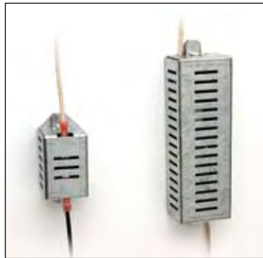
2600-580 Heater Kit

Easy to Use In-box Heater and Thermostat