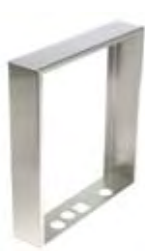
1814-152 Trim Ring