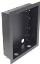
1803-150 Surface Mount Trim Ring