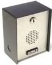
1804-193 External Speaker