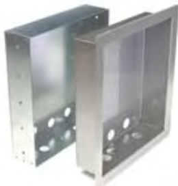
1814-165 Flush Kit Stainless Steel 2-piece