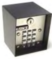
1814-075 Secondary Keypad