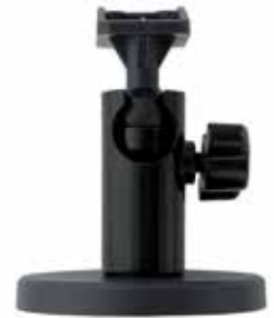
PROOUTMV-MB Mounting Bracket (not included in box)