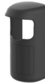
PROOUTMV-CT Curtain Sleeve (included in box)