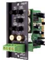
ANS1R with Sensor Microphone