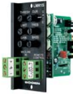
LMR1S with Remote Volume Control

Actively Balanced Emulated Transformer Inputs