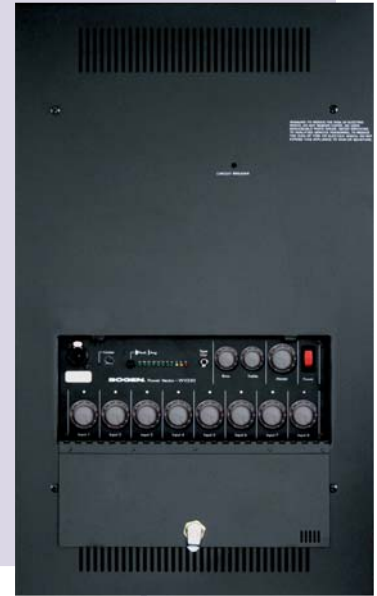
WV100, WV150, WV250