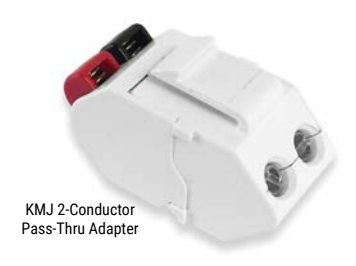
Replace "xx" with color choice: 00 = Electrical Ivory, 01 = Office White, or 12 = Bright White