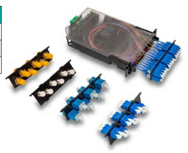
OCC Fiber Splice Cassette with Fiber Adapter Plates