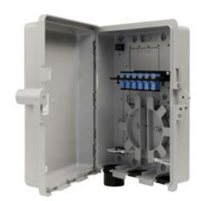
NEMA 3 Enclosure