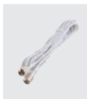
RG58U LOW-LOSS FOAM COAX CABLE N-MALE / N-MALE WHITE