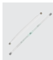
FLAT WINDOW CABLE F-FEMALE / F-FEMALE WHITE