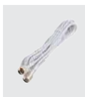
RG58U LOW-LOSS FOAM COAX CABLE N-MALE / N-MALE WHITE 951148 20 feet