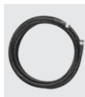
RG58 LOW-LOSS FOAM COAX CABLE SMA-FEMALE / SMA-MALE BLACK

955805 5 feet 951147 10 feet 955815 15 feet