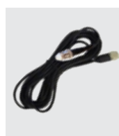
RG174 CABLE SMA-MALE / SMA-MALE BLACK 951151 3 feet