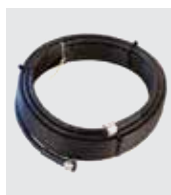
WILSON400 ULTRA LOW-LOSS COAX CABLE 2 N-MALE / N-MALE BLACK

950602 2 feet 950620 20 feet 950630 30 feet 950650 50 feet