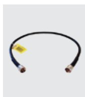
RG58U LOW-LOSS FOAM COAX CABLE N-MALE / N-MALE BLACK 951134 2 feet

955802 2 feet 955812 10 feet 955822 20 feet