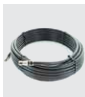
RG11 COAX CABLE F-MALE / F-MALE BLACK

951127 2 feet 951100 100 feet 951150 50 feet 951155 500 feet 951175 75 feet 1