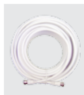
RG6 LOW-LOSS COAX CABLE F-MALE / F-MALE WHITE

1 compatible with crimp connector 971150. Center pin from connector. Must be soldered onto cable.