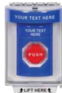
Universal Stopper® (Covers 3, 4, 7, 8)

No labeling can be placed on the Stopper Station shield.