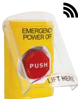
Stopper® Station Shield (Cover 2, A)

This inexpensive and highly durable cover, with or without alarm, was invented to mount directly onto the Stopper Station series of buttons with two tabs that snap into the Stopper Station shell. It takes hard knocks in stride while protecting the button against vandalism, damage and accidental activation. Ideal for use when space is limited.