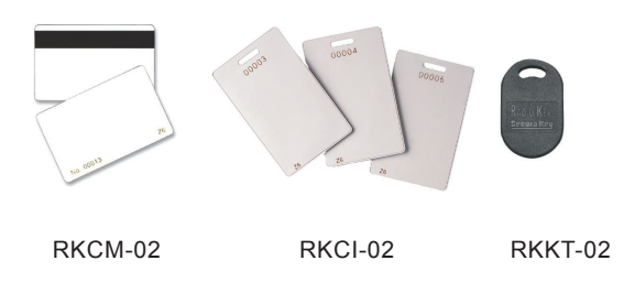
Figure 3 - Radio Key® Cards and Key Tags

NOTE: RKxx-01 cards or key tags will not work for the RKDT-SA-M/SA-S. The LED will flash amber to let you know it is the wrong type of card.