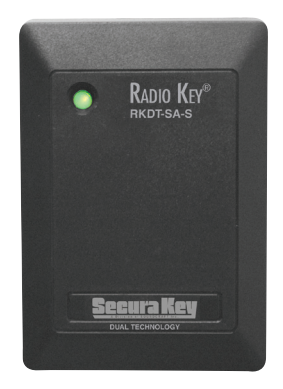
Figure 1 - Radio Key® RKDT-SA-M/SA-S