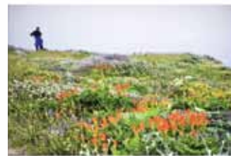
High color light output