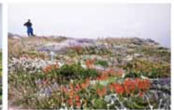
Low color light output

Actual photographs of images taken from two competing projectors run in default mode. Price, resolution and brightness (white light output) are the same for both projectors.