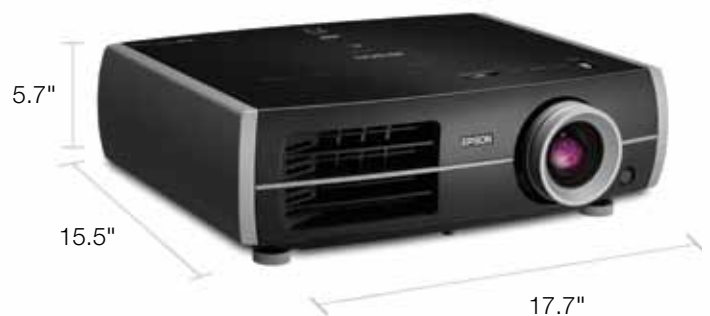
▲ Built for flexible installation

Actual photographs of images taken from two competing projectors run in default mode. Price, resolution and brightness (white light output) are the same for both projectors.