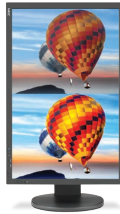
Picture by Picture shown with the same input, multiple color spaces

The PA243W allows for two different inputs to be shown simultaneously, which is useful for multiple computer configurations or even replacing multiple display setups. The same input can also be displayed in a second color space, which is most often used for a quick preview of an output color space (for example, sRGB) while working in a different color space (for example, Adobe RGB). This saves the time used to switch back and forth between color spaces as final editing tweaks are made.