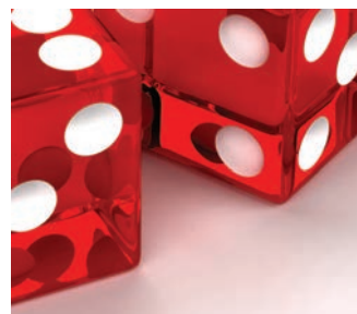
10 bit color eliminates banding

The MultiSync PA243W offers 10 bit color support over DisplayPort and HDMI inputs for increased color fidelity when matched with a 10 bit operating system and software applications.