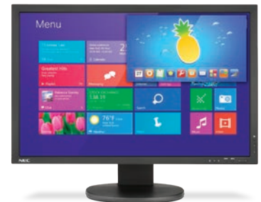
Picture in Picture shown with 2 separate inputs