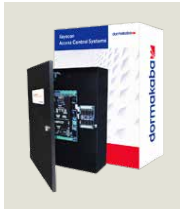
CA4500 4-door control unit