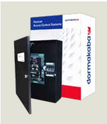
CA250 2-door control unit

** requires CIMs and CIM Link communication modules