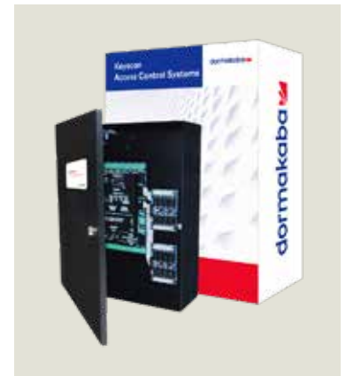
CA8500 8-door control unit