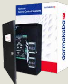
EC2500 2 cab elevator floor controller (Supports 2 Cabs/ 2 readers)