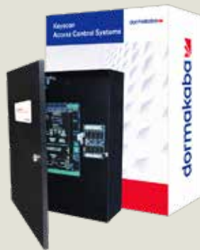
EC1500 1 cab elevator floor controller