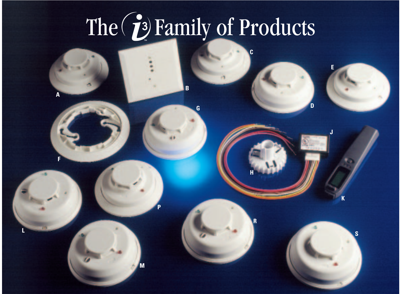
A 2W-B, 2-wire Standard i 3 Detector

B 2W-MOD2, i 3 Loop Test/Maintenance Module – Interprets the i 3 remote maintenance signal, provides a visual indication when a two-wire i 3 detector requires cleaning and transmits the maintenance signal to the panel. Also offers the EZ Walk loop test, a style D initiating circuit and an interface for two-wire detectors to be used on a four-wire loop.