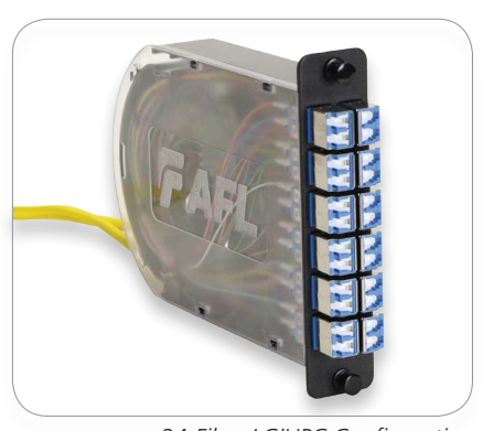
24-Fiber LC/UPC Configuration