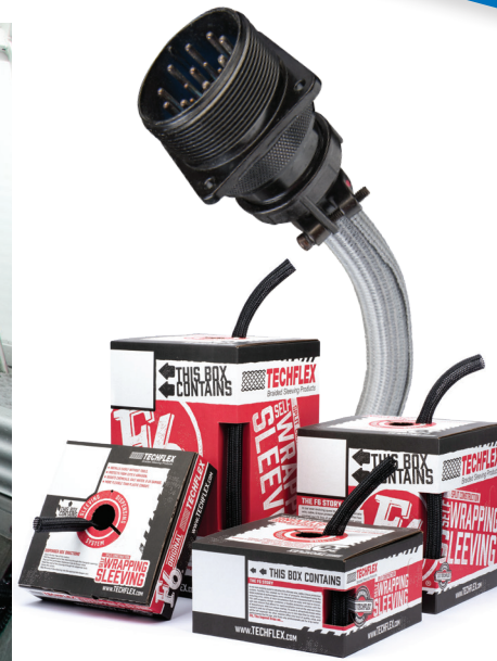
F6® is available in self-dispensing boxes.