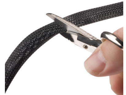
Clean Cut® cuts easily and neatly with regular scissors and maintains a fray resistant end during installation.