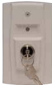
RTS151KEY UL S2522