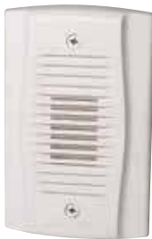
MHW UL S4011