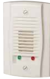
APA151 UL S4011