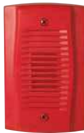
MHR UL S4011