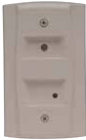
RTS151 UL S4011

System Sensor provides system flexibility with a variety of accessories, including two remote test stations and several different means of visible and audible system annunciation. As with our duct smoke detectors, all duct smoke detector accessories are UL listed.