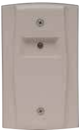
RA100Z UL S2522