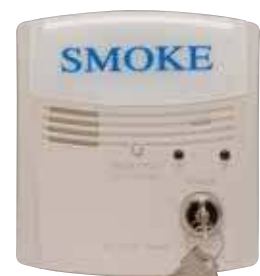
RTS2-AOS UL S2522