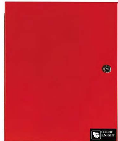
5496 Intelligent Power Module