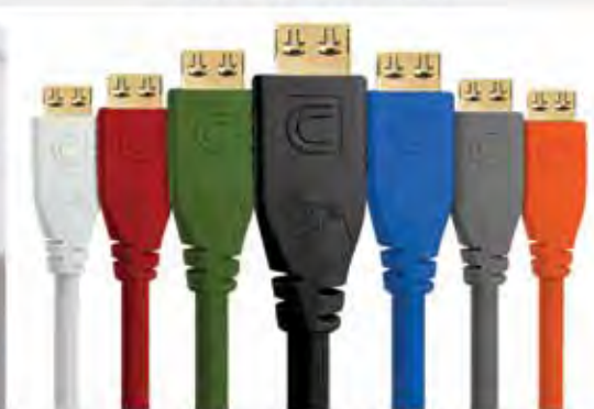
Pro AV/IT HDMI Cables