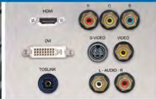
Plates and Panels