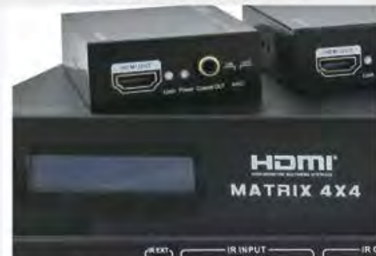
Switchers and Extenders