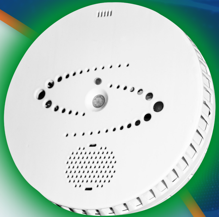
HALO Smart Sensor is Multi-Patented and Design is Trademarked

New security and environmental monitoring features provide users with even greater levels of security and easier installation. These features add to HALO's existing features of gunshot detection, noise alerts, and emergency keyword alerting.