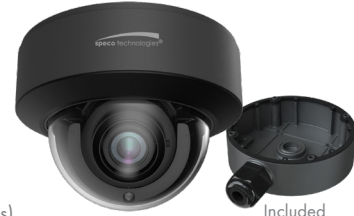
Included Junction Box