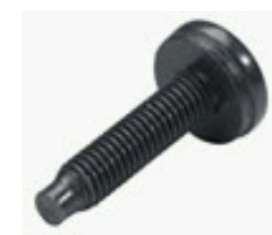
self-guided pilot point

HG hardware is recommended for use in humid and marine applications