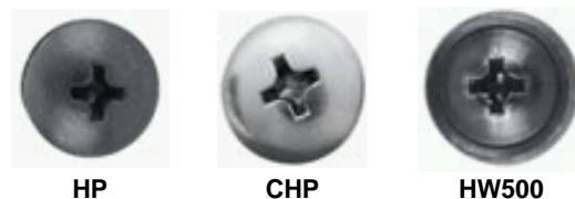
HP CHP HW500

Standard 1/2" long rack screws with 10-32 threads feature self-guiding pilot points. HP Series truss head screws provide a clean, modern appearance under optional trim strips (see pg. 120) for the most attractive finish. HW S trim-head screws feature an older, classic appearance. Includes factory installed nylon washer.