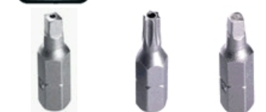
SPBIT TBIT SBIT