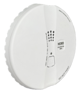
CM-E1 (Round housing flush mount)