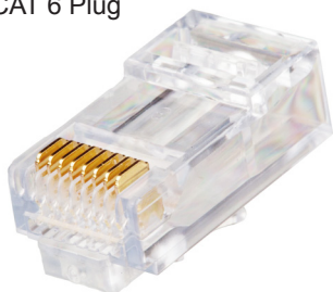
EZ-RJ45 CAT 6 Plug

The EZ-RJ45 CAT 6 Plug and Crimp Tool provides quick, cost-effective UTP wire terminations. The plug features openings that allow wires to be inserted and extended out of the front, providing increased performance, wire sequence verification, and no wasted connectors, crimps, or bad terminations. The crimp tool features a built-in cutter and stripper that crimps and cuts wires in one operation. It accommodates EZ-RJ45 plugs, and most standard RJ-45 and RJ-11 plugs. This craft-friendly tool features precision ground-crimp dies, a full-cycle ratcheting mechanism, and steel construction for strength and durability.