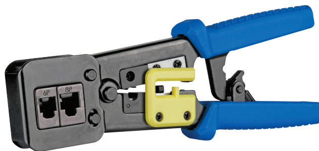
Recommended Tool: EZ-RJ45 Crimp Tool

For a copy of Leviton product warranties, visit www.leviton.com/warranty .