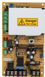
LP250B mother board