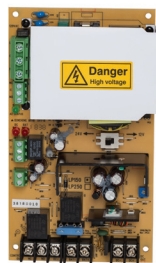
LP150B mother board