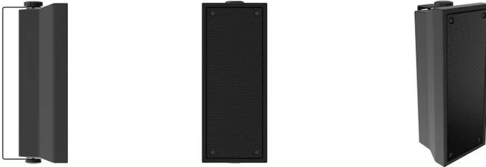
AC FIVE 3