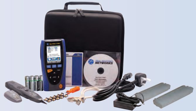
NavITEK II PRO - Premium kit