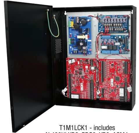
T1M1LCK1 - includes AL400ULXB2, PDS8, VR6, ACM4, wire harnesses and wire magnets

Altronix T1M1LCK1 is a 4-door access and power integration kit which includes Altronix power and sub-assemblies along with factory installed wire management and wire assemblies that are pre-configured with terminal blocks for Mercury* hardware. This unit provides ample power and dual voltage outputs to support Mercury platform controllers and locking devices. The T1M1LCK1 accommodates one (1) Intelligent Dual Reader Controller and one (1) Dual Reader Interface Modules. Trove Plus simplifies field installations and provides reliable, robust critical power and control for the most demanding applications.