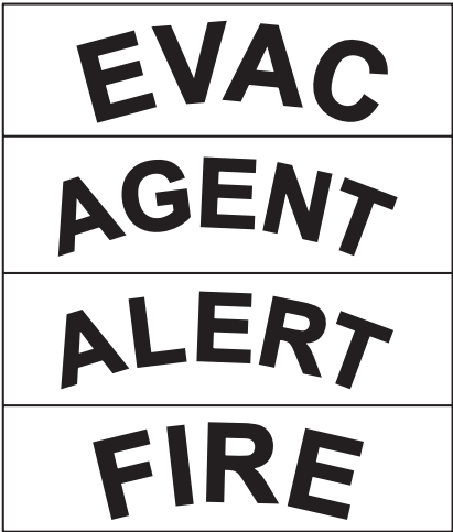
FIGURE 2: CEILING DECAL