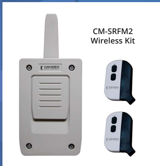
CM-SRFM2 Wireless Kit

CM-SR Series wireless system includes a high security stand-alone wireless receiver with (2) Form 'C' relay outputs. The receiver features a rugged construction with a built-in antenna for mounting indoors or outdoors.